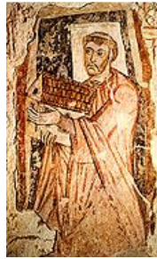
St. Benet Biscop