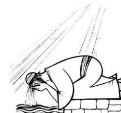
The man blind from birth went off and washed himself in the Pool of Siloam