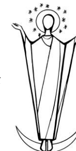
Mary Queen of the Universe 22 August

"Sir, Son of David,, take pity on me. My daughter is tormented by a devil". Jesus replied "Woman you have great faith. Let your wish be granted."