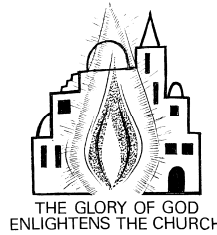
THE GLORY OF GOD ENLIGHTENS THE CHURCH