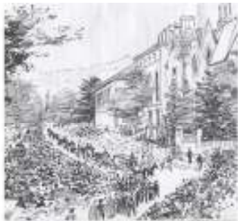
Cardinal Newman's funeral

Cardinal Newman was not only a great intellectual and author, but he was also a pastor. At his funeral 15,000 people lined the streets of Birmingham. Many of them were the poor people of Birmingham who loved their Cardinal because he loved them. Next week the parish will hear about the proposed parish Newman fund.