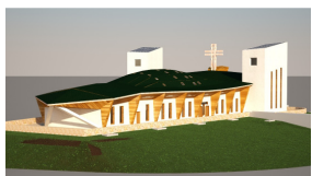
New Church Guinea Bissau To be built