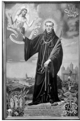
Picture of St. Alban Roe at Ampleforth

St. Alban Roe loses his feast day this year as 31 st January is a Sunday. He is the only monk of Ampleforth declared a Saint (one of the 40 English Martyrs) and died a martyr in 1642 on the 21 st January (but with the change of the calendar in 1752 in Britain the date became 31 st January). We can ask him to pray for us all because he was always cheerful despite his sufferings (22 years in prison as a monk / priest) and did wonderful apostolic work in London.