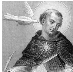
St. Thomas Aquinas