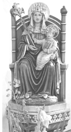
Our Lady of Walsingham