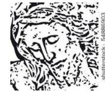
Jesus Christ is the face of the Father's Mercy

COMMUNION FOR THE SICK The Congregation says: May this sacrament unite them with Christ and his Church and give them consolation and peace.