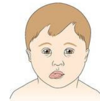
Downs Syndrome boy