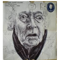
Elderly man with dementia