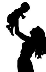
Single Mum and new baby