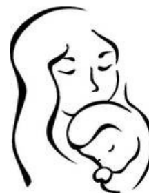
The unborn child remembered by his/ her mum

"In our culture there seems to be a growing carelessness about the sanctity of life. Those who are the most vulnerable and those who need the most care seem to be the ones who most easily discarded, whose human dignity is quickly forgotten"