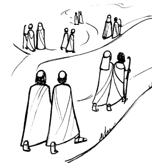
Jesus sent them out in pairs