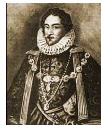
Roger Manners 5 th Earl of Rutland